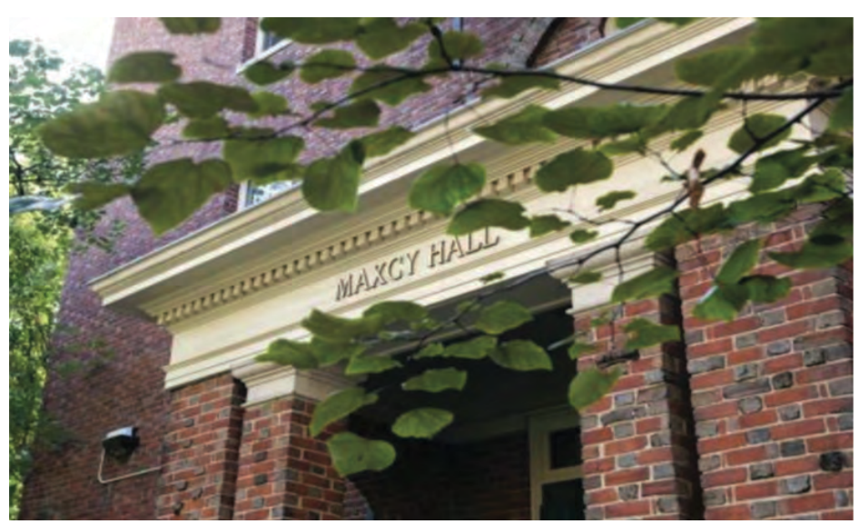
The beautiful entrance to our new department building!

In this thesis she will contrast and compare the characteristics and consequences of these two prevalent forces in Johannesburg, particularly focusing on their intersection in Johannesburg's heavily fortified 21st Century gentrified spaces.