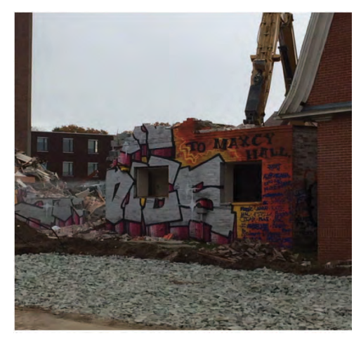
The demolition of the former department building on Manning.