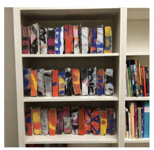
Graffiti-covered bricks from the old urban studies building.