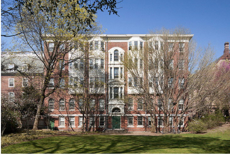
Maxcy Hall on Simmons Quadrangle, where the department will move come fall 2015.