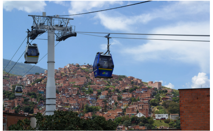
Metrocable Cars in Medellin, Colombia