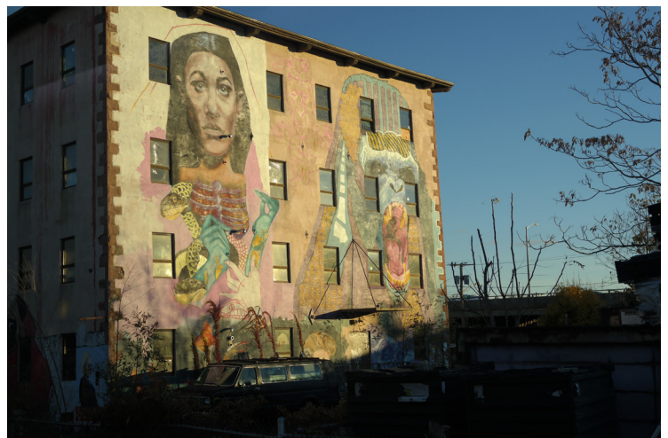
Graffiti Mural on the West Side of Providence

The next stage of the research will be to overlay the student-generated map of graffiti atop the Providence crime map and look for a relationship. The research will be written up and submitted for consideration for publication in an urban studies-related journal in the coming academic year.