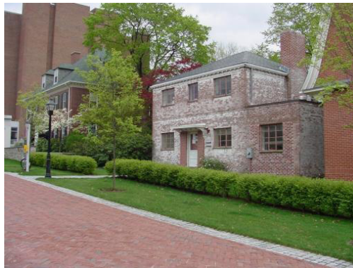
29 Manning Walk, current home of the Urban Studies Department. The space will be torn down later this year.

In preparation for the demolition of 29 Manning Walk, current home of the Urban Studies program, faculty and staff offices will relocate to Maxcy Hall on Simmons Quadrangle by the onset of the fall 2015 semester. Maxcy, which sits behind Wilson Hall and across the Quadrangle from Lyman Hall, is the current home of the University's Sociology department.